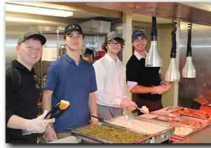
Brothers serving guests at our annual Chicken Benefit Dinner