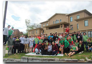
Group picture after our 2023 Watermelon Bash fundraiser