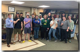
Alumni visit chapter to give brothers career fair and resume advice

When you join Lambda Chi Alpha, you become an associate member. As opposed to being a 'pledge,' associates hold the same rights as active members. This includes voting at meetings, wearing house letters, and even being able to hold officer positions. Additionally, all members do house duties and pull their own weight no matter their class status. Associates will experience a fraternal education program their first semester to teach them about the fraternity, professional skills, and time management.